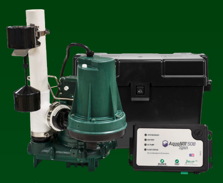
AquaNot Spin 508

Pre-piped Combination Battery Backup And Primary Pump Systems