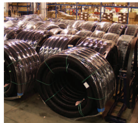
R-flex coils ready to be shipped.

If there is a need to transfer heated water, or water/glycol, from one location to another, then there is a need for R-flex.