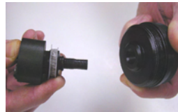
P/N 21999-0177 Moisture Minder® EDV Electronic Drain Valve

Remove float drain, apply thread sealant to 1/2" NPT threads on EDV and install to bottom cap.