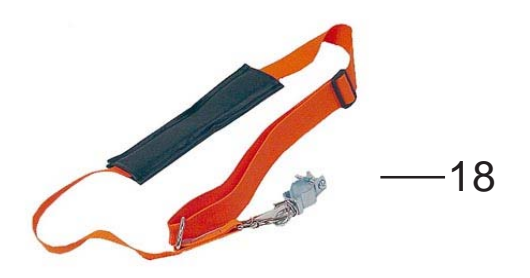
Single Shoulder Strap Model#: 746191

WARNING! Read the owners manual and follow all warnings and safety instructions. Failure to do so can result in serious injury to the operator and/or bystanders. Never attempt to mount a steel blade to a machine that is not specifically designed for that purpose. Never attempt to mount a steel blade without using all components of the blade attachment kit, including shoulder strap and barrier safety bar.