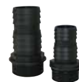
1 1/2" and 2" Barbed Fitting