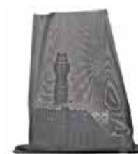
Pump Bag Included