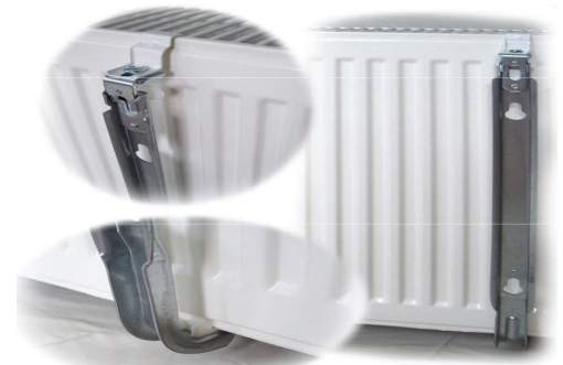
Pensotti Snap-Grip mounting brackets make radiator installation and removal a snap