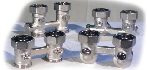
Four different radiator valves are available to make system design, installation and maintenance quick and easy

Pensotti Panel Radiators are quick and easy to install with the supplied snap-in mounting brackets, bottom pipe connections and reversible mounting.