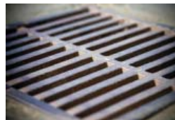
PUMPING FROM PONDS, PITS, TANKS, SUMPS, ETC.