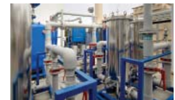
RECIRCULATION, MIXING, FILTRATION, ETC.