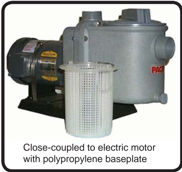
Close-coupled to electric motor with polypropylene baseplate

The self-priming Series 'G' pump is made in either Noryl® or Ryton®, providing a maximum range of chemical resistance. It is available with stainless steel or titanium internal hardware or complete non-metallic solution contact. The pump comes standard with stainless steel external hardware. It is protected with a basket type strainer in either Polypropylene or ECTFE. The large cover makes initial priming and removal of the strainer quick and easy. The cover is the same material as the pump or it can be ordered in clear Lexan®.