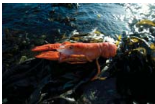
AQUACULTURE LOBSTER FARMING FISH PONDS

After initial prime the Series 'G' pump will lift up to 10 vertical feet (3.1m) and will remain primed even after shutdown. This pump also features an open, non-clogging impeller which is molded in conjunction with the shaft sleeve, thus isolating the shaft from solution contact. The self-priming ability, chemical resistance, light weight and basket strainer make this an ideal chemical transfer, waste treatment, emergency/backup or filter pump.