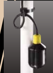
Wide Angle Float (Sewage/Effluent application)