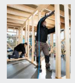
Construction Powering impact guns, ratchets, grinders, drills, nailers, paint sprayers, sanders and more