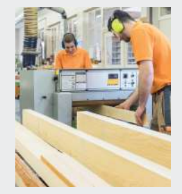
Woodworking Sawing, clamping, hoisting, actuation & controls, pressure treatment