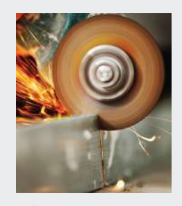
Painting, sandblasting, finishing, material handling, welding, cutting