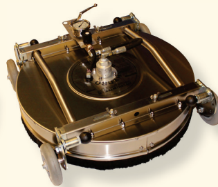
Use pop pins to adjust height of deck, no tools needed.