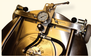
Pressure adjustment with gauge and water supply on/off ball valve on deck.