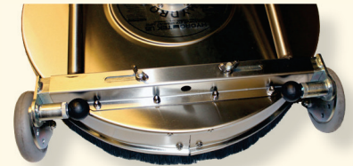
Slide wheels in or out to adjust width for different roof styles.