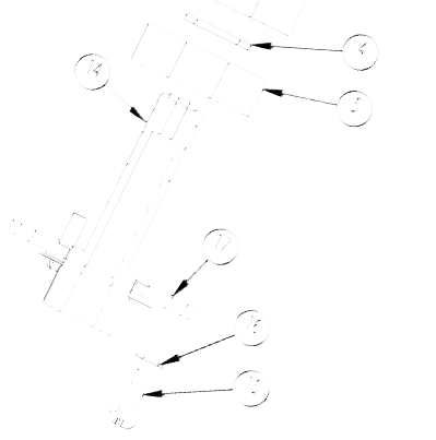
Ref 300843 Rev. F 05-16