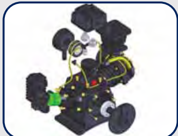
Ram-Tek: Solid Steel, heavy gauge rods for maximum performance & durability