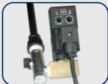
Auto Tank Drain eliminates daily maintenance