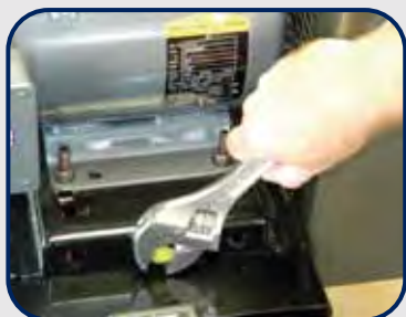
Belt Tension Adjuster: Fast, easy "one turn" design reduces vibration and extends belt life