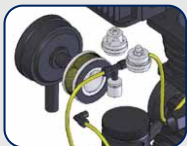
Flow-Tek™: Concentric Disc Valves for maximum Performance & Longevity