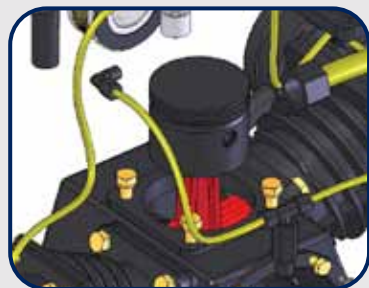
Ram-Tek: Solid Steel, heavy gauge rods for maximum Performance & Durability