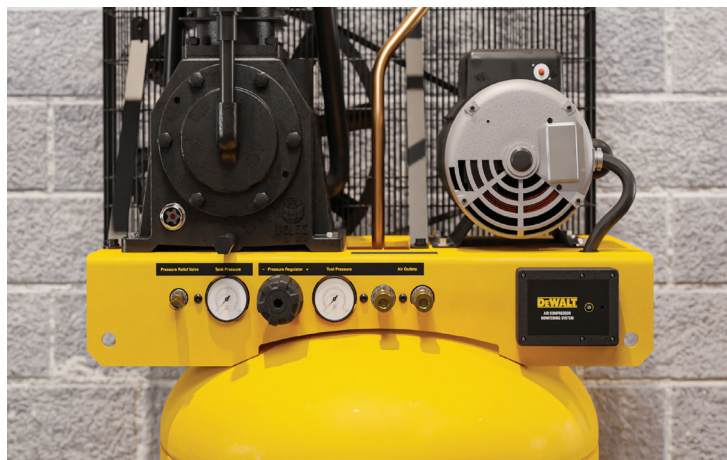
Seamlessly integrated with DeWalt air compressors