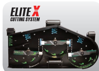
50", 60", and 72" Elite X Deck – Handles all grass types in any situation.