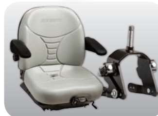
High Performance Package – Comes standard on HP and EFI models.