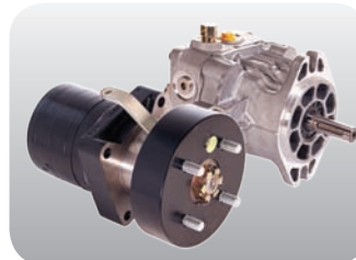
Pumps & Wheel Motors – Stronger transmissions for extended system life.