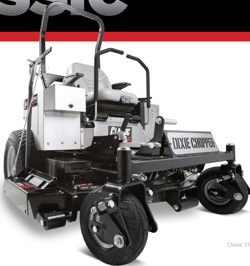
Classic 3160HP shown*