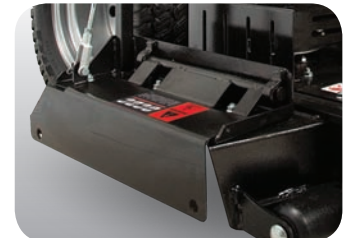
OCDC – Open and close the discharge chute on command.