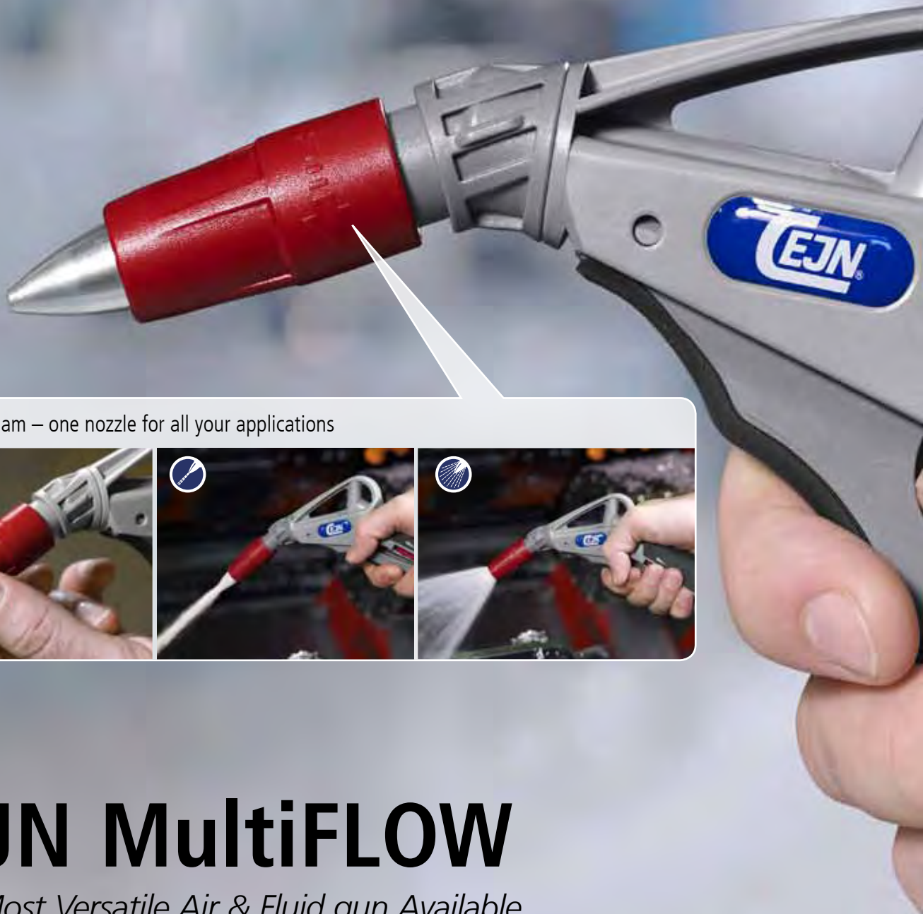
Adjustable beam – one nozzle for all your applications