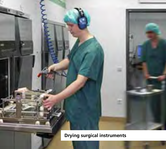
Drying surgical instruments