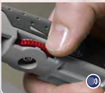
Adjustable flow for specific application needs