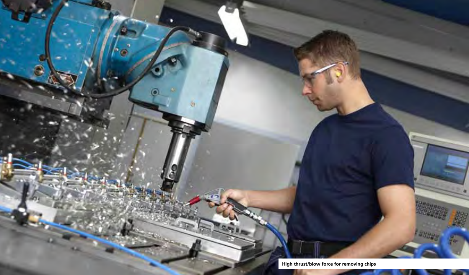
High thrust/blow force for removing chips