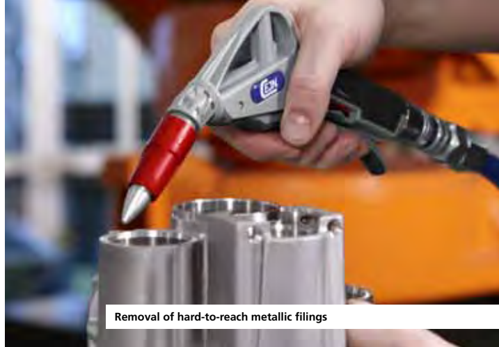
Removal of hard-to-reach metallic filings