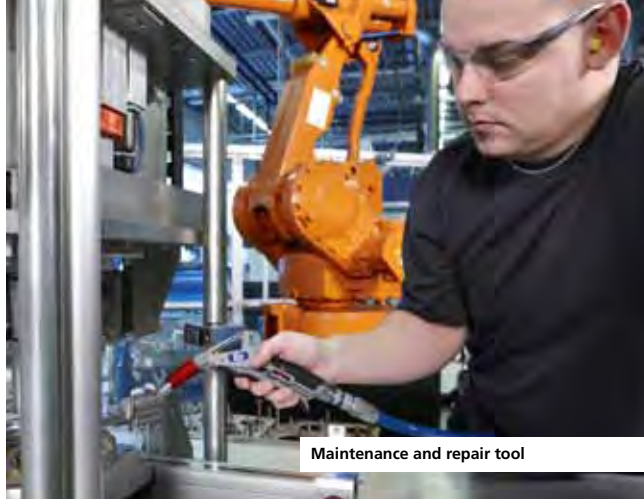
Maintenance and repair tool