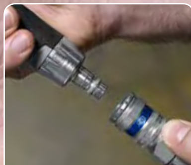
Low disconnection noise