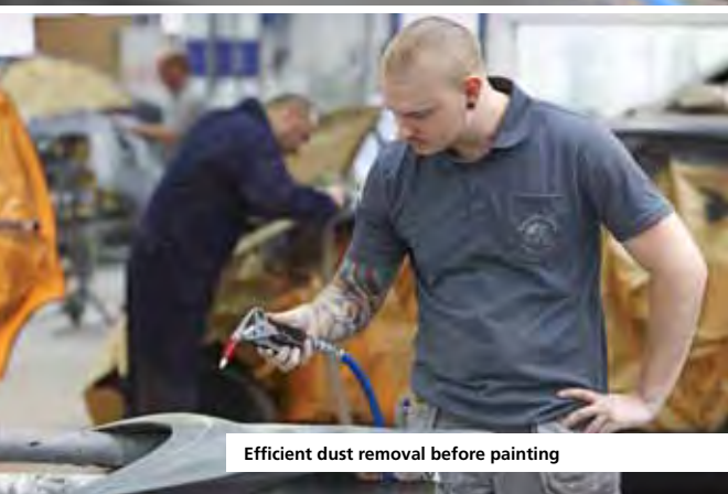
Efficient dust removal before painting