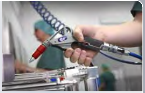
Extreme flow for cleaning, cooling and drying