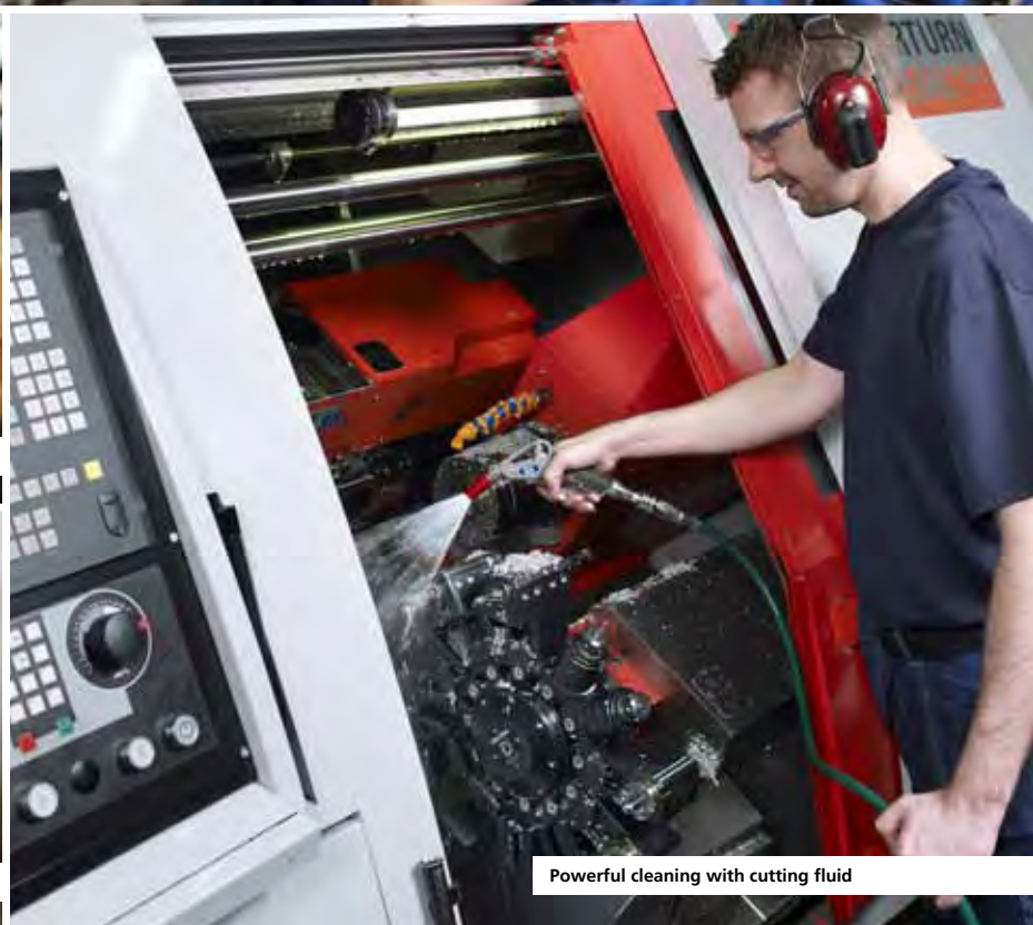
Powerful cleaning with cutting fluid