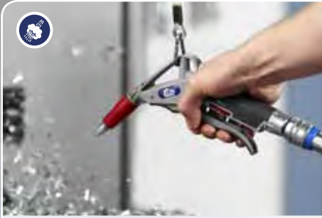
Air and fluid flow