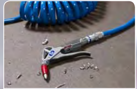
Withstands rough environment