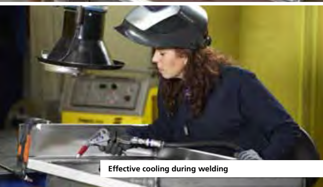
Effective cooling during welding