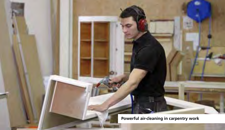
Powerful air-cleaning in carpentry work