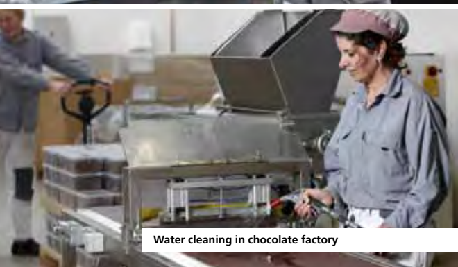
Water cleaning in chocolate factory