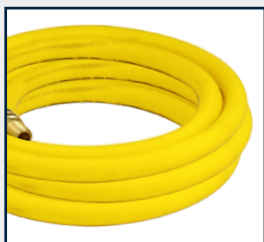
LIGHTWEIGHT & FLEXIBLE MATERIAL