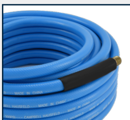
FLEXIBLE PVC MATERIAL