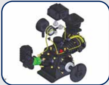
Flow-Tek™ Concentric Disc Valves for Maximum Performance & Longevity