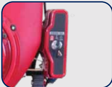
Electric start standard on all models over 8HP