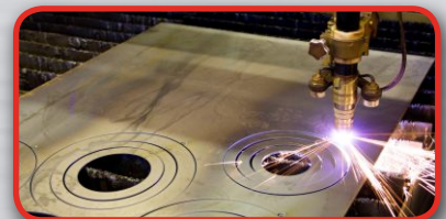
Cutting Tools Industry