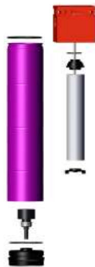
Figure #2: Oil Coalescing Filter