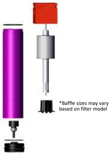
Figure #1: Water Separator