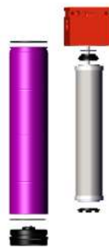
Figure #3: Activated Carbon