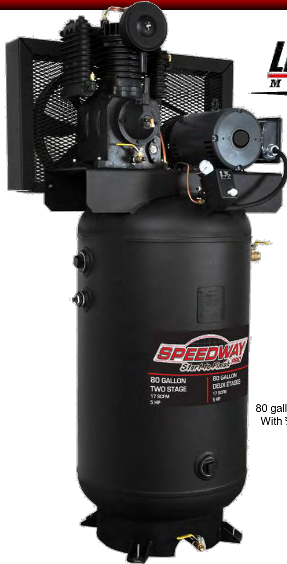
7654 80 gallon (2 Stage) With 3/4" air outlet