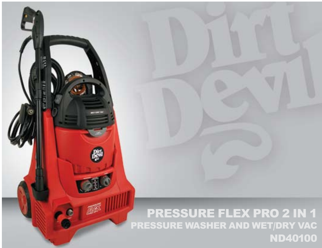
PRESSURE FLEX PRO 2 IN 1 PRESSURE WASHER AND WET/DRY VAC ND40100