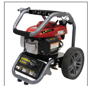
HANDLE STORAGE POSITION PROTECTS UNIT AND FITS INTO COMPACT SPACES