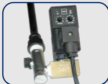
Auto Tank Drain eliminates daily maintenance