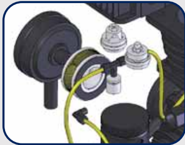
Flow-Tek™: Concentric Disc Valves for maximum Performance & Longevity