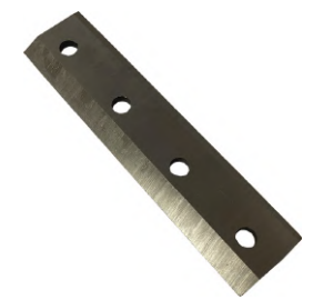
PK0913DD08 - Replacement Blade for PK0913DD 2.8" Chipper Shredder

PK091514 - All weather cover for PK0915-EH 5", PK0915 5", PK0903 4" EH 5", PK0915 5", PK0903 4" Chipper Chipper Shredder