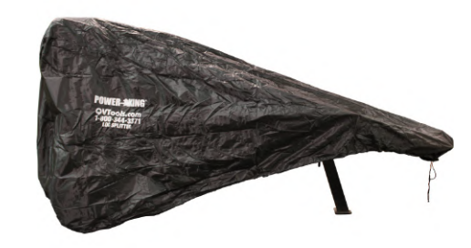
PK0322K17 - All Weather Cover for PK0322K 22-Ton Kinetic Log Splitter

PK034211 - All Weather Cover for PK0342 42-Ton Kinetic Log Splitter