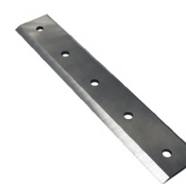
PK090301 - Replacement Blade for PK0915-EH 5", PK0915 5", PK0903 4" Chipper Shredder